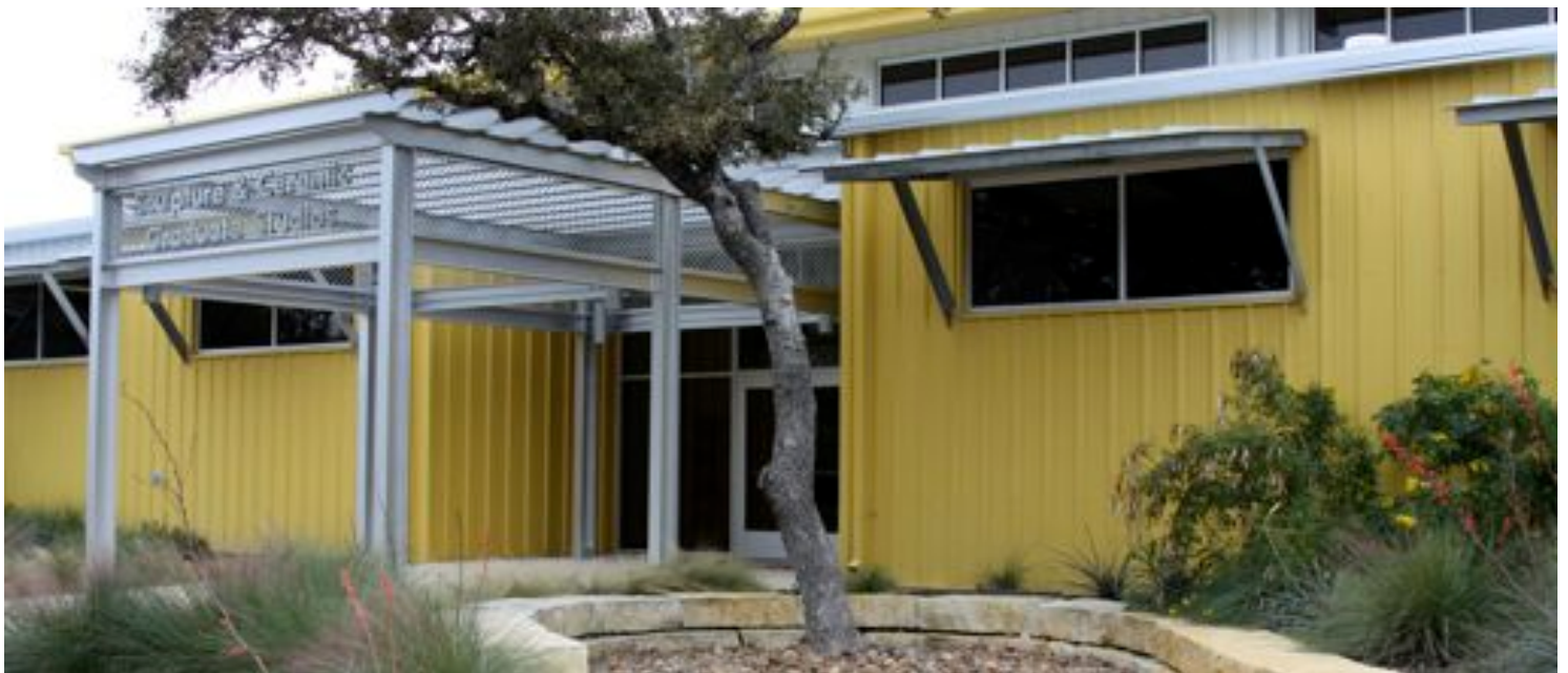
The new 3.5 million dollar UTSA Sculpture and Ceramics Graduate Studios