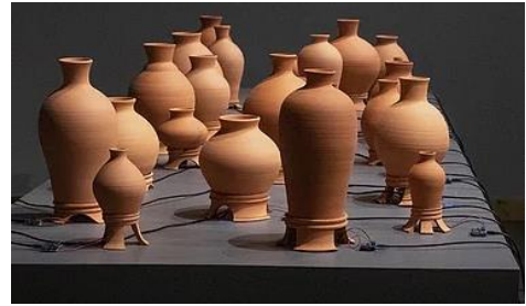
Image: "The Inh(a/i)bited Space" Multimedia Installation, Ceramic Vessels, Wire and Sound, 2018

Through my years of multi-disciplinary practice, I've managed to keep pace with the rapidly changing socio-political debates around the world and their relative expansive influences on human conditions. Immigration, borders and cultural communications are today's most fundamental discourses which are immensely interwoven with notions of identity, belonging and inhabitation. Therefore, art could be an intermediary language shared between individuals, nations and cultures, addressing these issues by touching the innermost layers of personality.